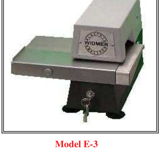
With optional security lock and adjustable guide shelf

7 1/4" (H) x 4 3/4" (W) x 10" (D) 18.4 cm (H) x 12 cm (W) x 25.4 cm (D) Shipping Weight: 17lbs, 6.3 kg. Two-tone light & dark Gray finish